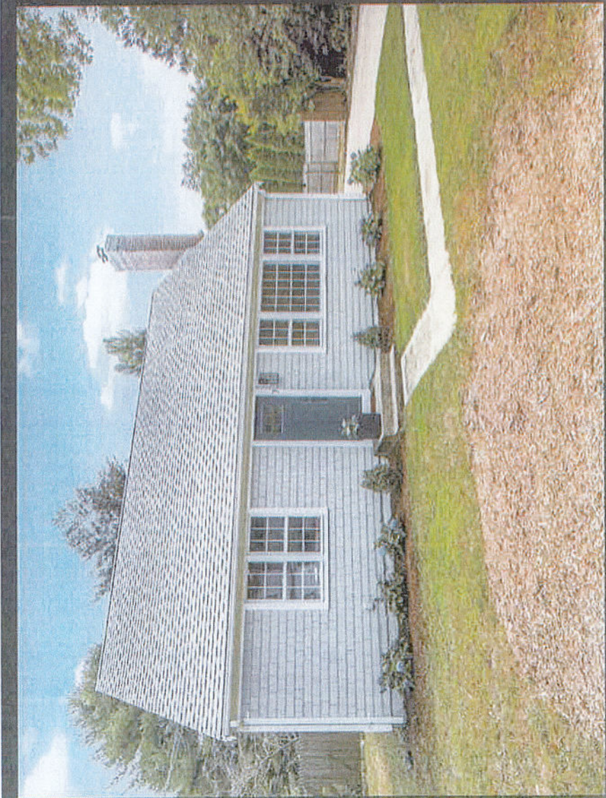
Alderberry Lane - Falmouth Housing Trust