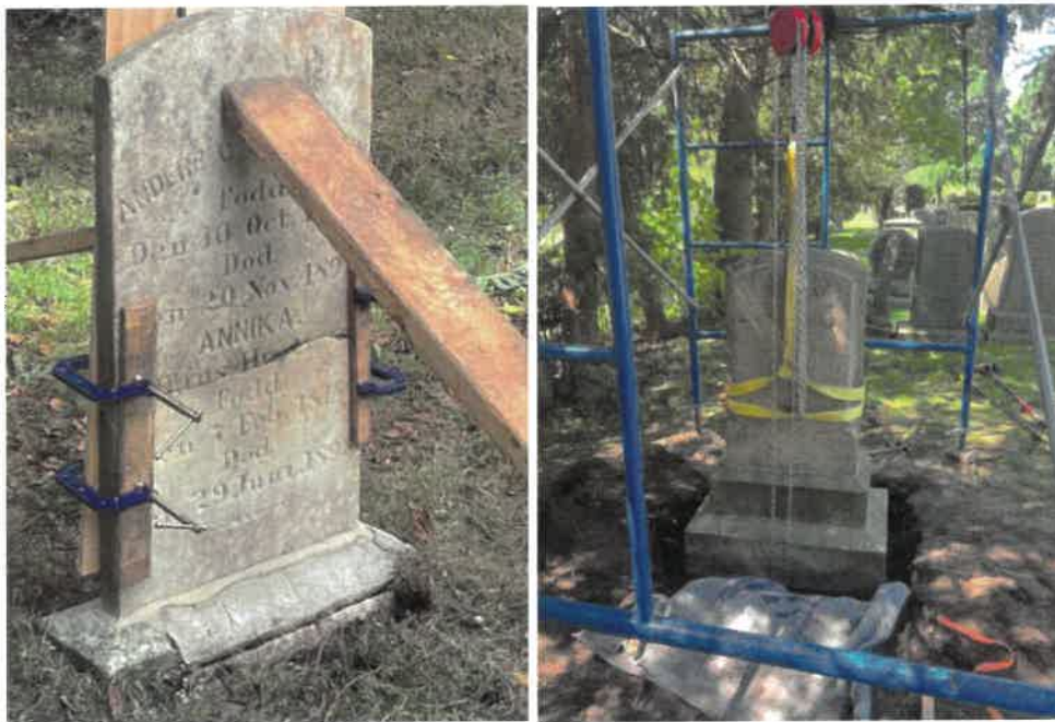
Photos are from vendor website of work at other cemeteries showing care and skill required for these types of restorations