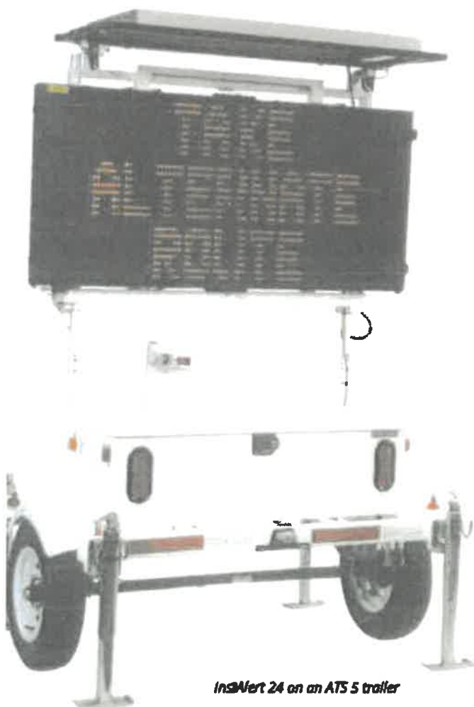
InstAlert 24 on an ATS 5 trailer

InstAlert is shatterproof, graffiti-resistant, and built to last for a decade or more, even through harsh weather conditions.