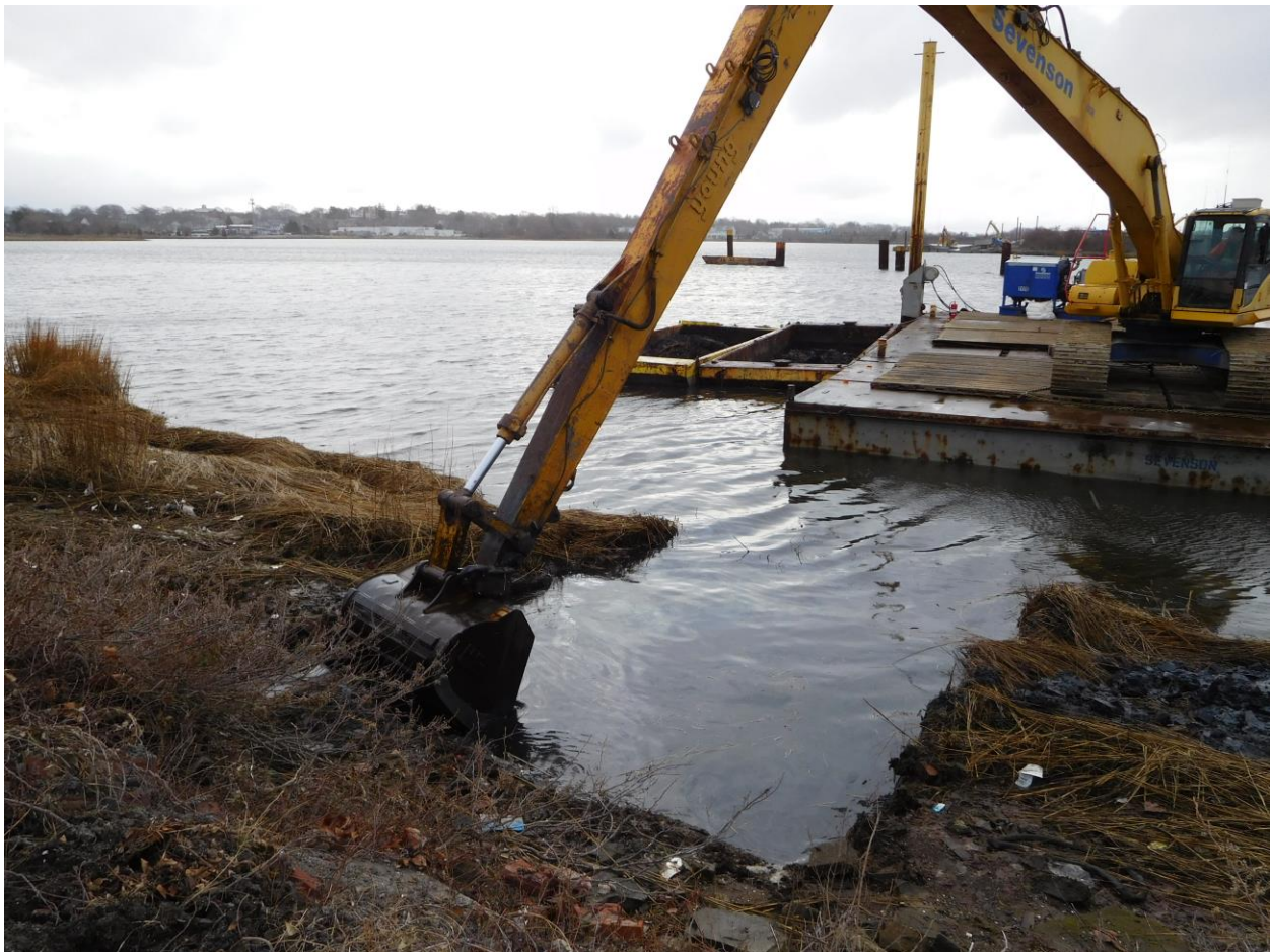
Sediment dredging near Riverside Park