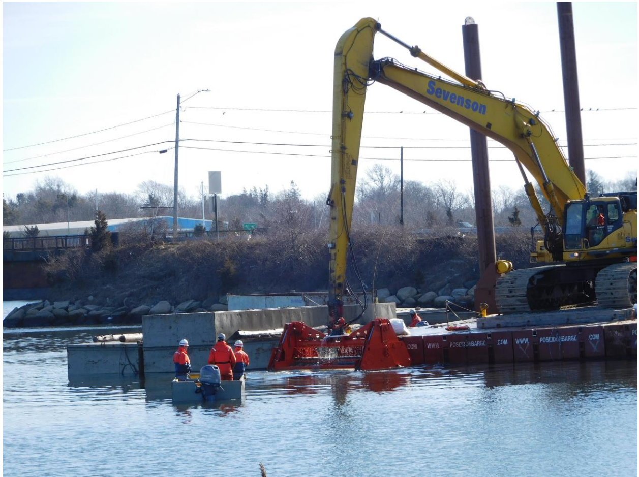
Mechanical dredging in the Upper Harbor in early 2017