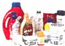
Plastic Bottles, Jugs & Jars