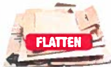
Cardboard & Paper Bags